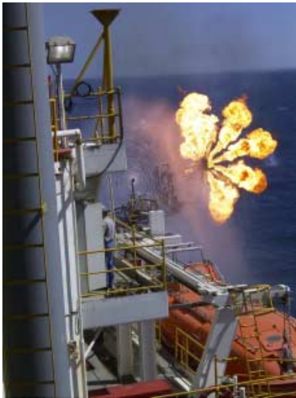
Testing of Cliff Head 3 Appraisal well at 3,000 BOPD